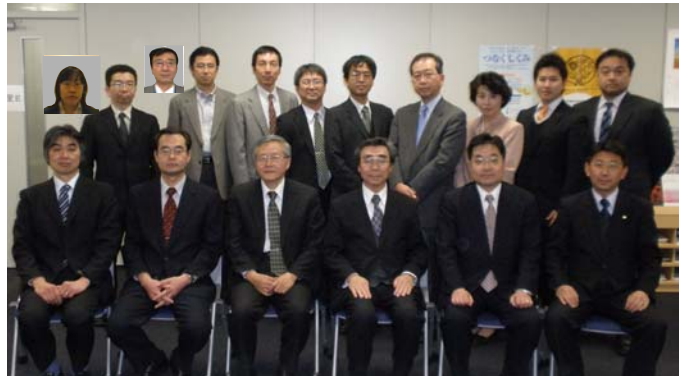
Members of board of trustees